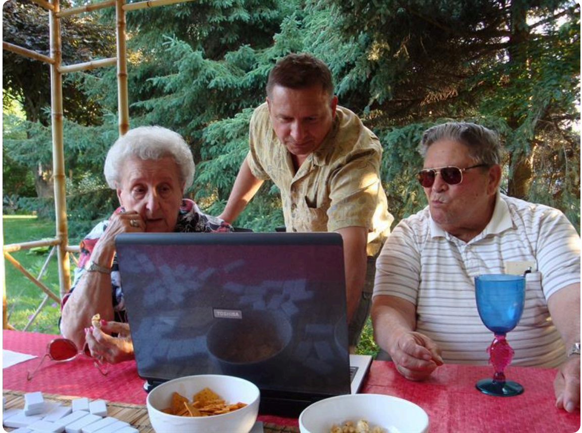
Dominoes and Facebook